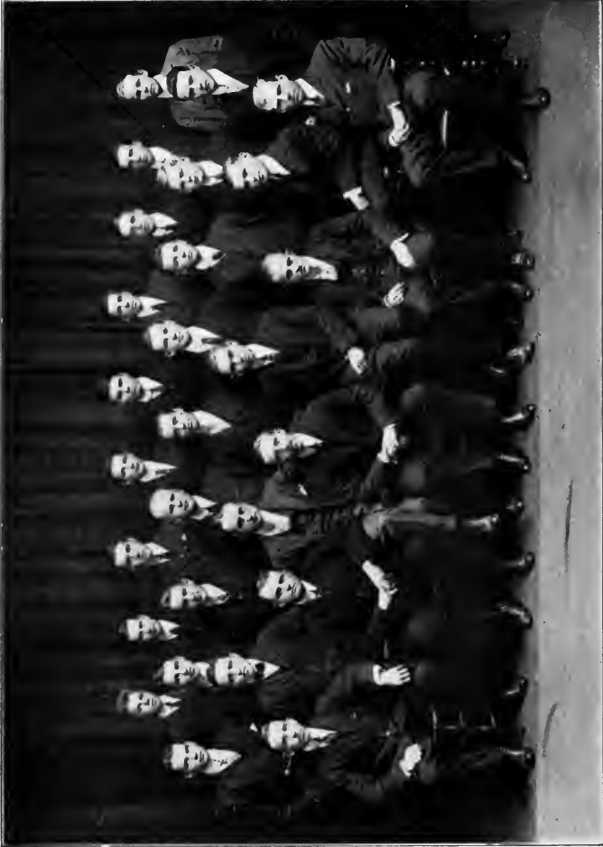
THE YALE UNIVERSITY DRAMATIC ASSOCIATION, 1910-1911.